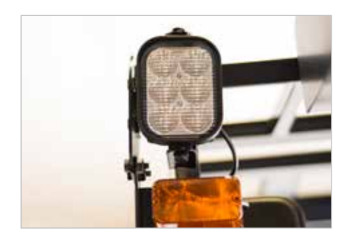
LED lights OPTION

Brighter and last longer than traditional sealed beams or halogen lights.