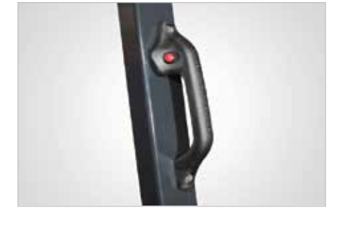
Rear grab handle with horn OPTION

The angle sensing information controls the travel speed when turning sharply. It automatically reduces the travel speed to the optimal speed when cornering, reducing the risk of accidents or damage.