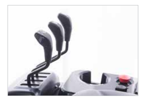
Hydraulic lever with directional switch OPTION

The direction switch is located on the lift lever, which makes it easier for the operator to quickly change between forward and backward driving direction.