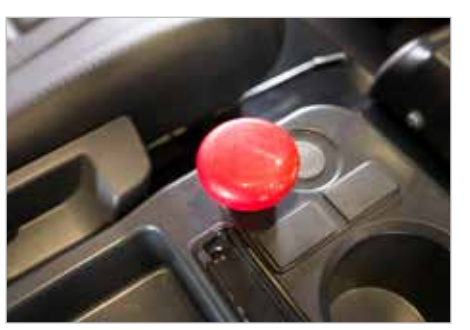
Emergency switch OPTION

Brighter and last longer than traditional sealed beams or halogen lights.