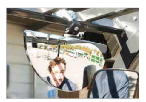
Large panoramic mirror OPTION

The emergency switch can be reached easily when operating the truck.