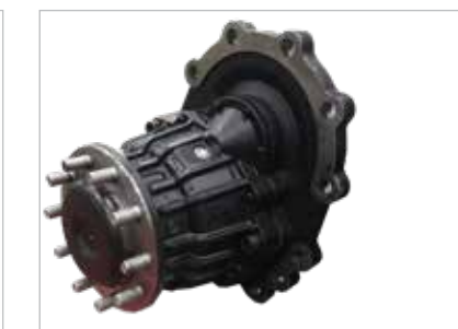
Rugged and durable twin drive axle

There are 3 to 5 double-sided discs per wheel. Discs are submerged in oil, keeping them cool and limiting wear. The Doosan ODB system is completely enclosed and sealed from outside contaminants protecting the inner workings of the brake system from dirt, water, shrink wrap and broken pallets. Oil cooled disc brakes have a 5 times longer service interval than conventional shoe brakes and are virtually maintenance-free.